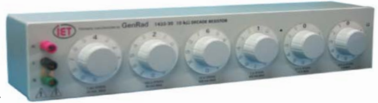
Model 1433 Precision Decade Resistor

The 1433 Decade Resistors are primarily intended for precision measurement applications where their excellent accuracy, stability, and low zero resistance are important. They are convenient resistance standards for checking the accuracy of resistance measuring devices and are used as components in dc and audio frequency impedance bridges. Many of the models can be used into the radio-frequency range.